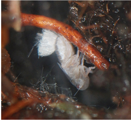
FIGURE 2: Fifth instar C. meridionalis nymph feeding on a root of Empetrum nigrum in a terrarium.